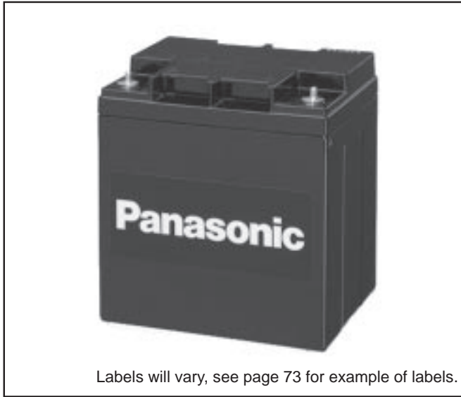
Labels will vary, see page 73 for example of labels.

(a) The photo and dimensions represent LC-XC1228AP